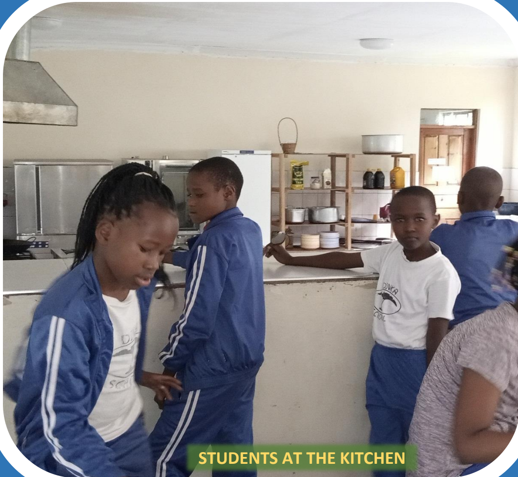
STUDENTS AT THE KITCHEN