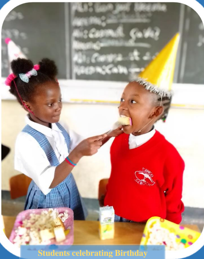
Students celebrating Birthday