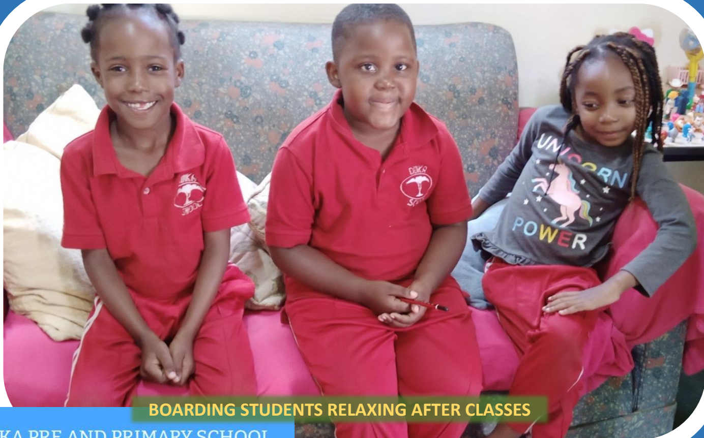
BOARDING STUDENTS RELAXING AFTER CLASSES