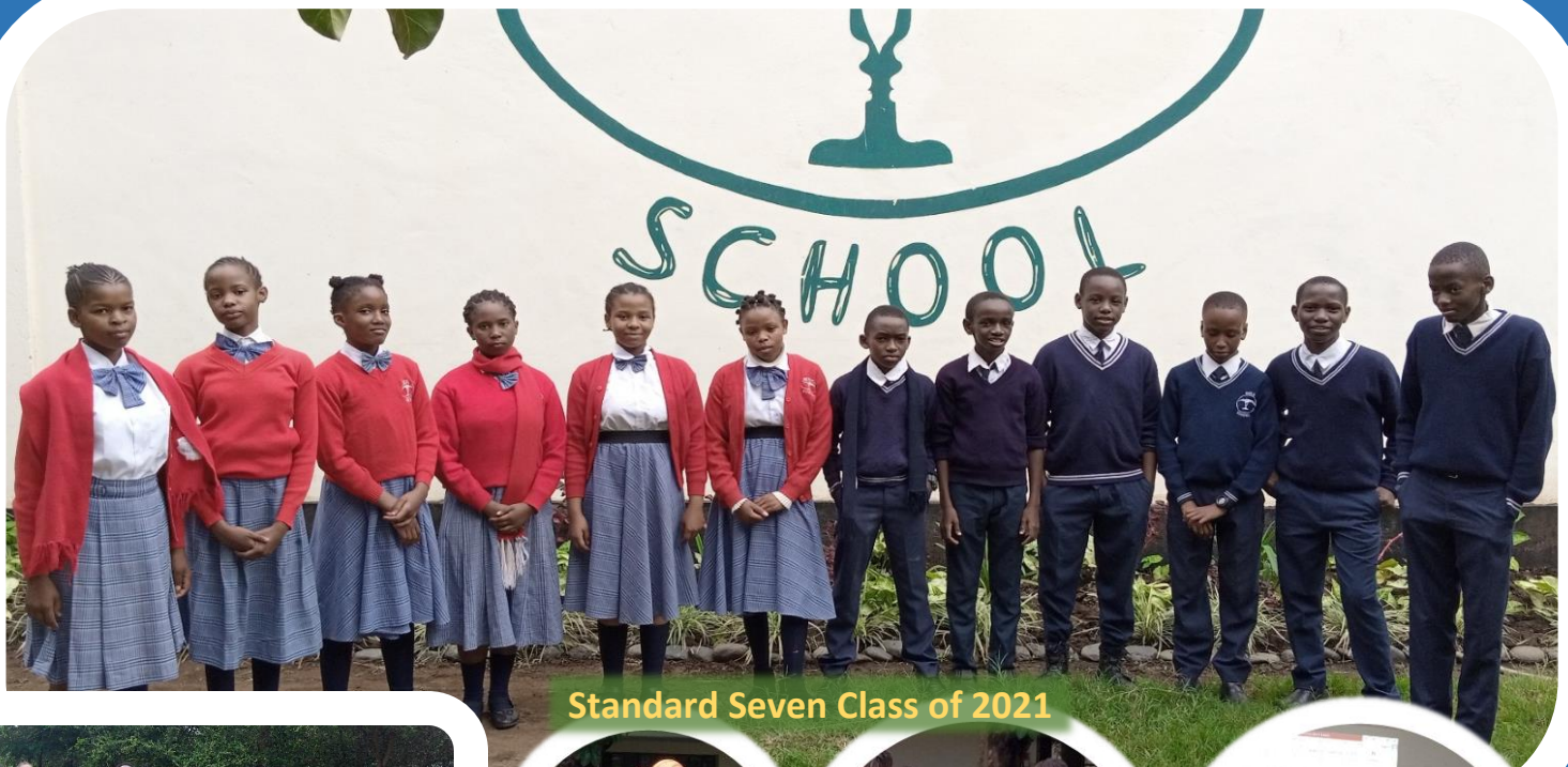
Standard Seven Class of 2021